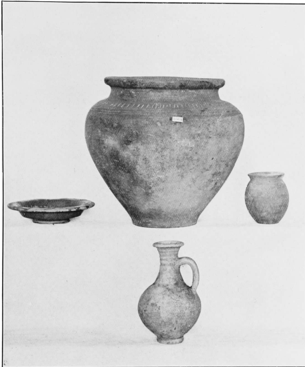
Plate I.—Burial Group 1.

Four associated objects, i.e. Cinerary Urn, Jug, Beaker, and Samian Ware Dish. (In Letchworth Museum, the Kindersley Collection.)