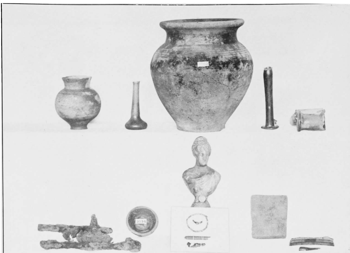
Plate II.—Burial Group 2. Thirteen associated objects, i.e. Cinerary Urn, Beaker, Statuette, Bronze Neck Ring and Finger Ring, Fibula, Fragments of Iron Lamp Holder, Fragments of four Glass Vessels, Salve Pot and Palette. (In Letchworth Museum, the Kindersley Collection.)