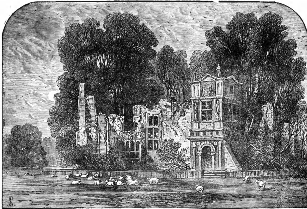
THE PRESENT STATE OF GORHAMBURY HOUSE. Built 1563, by Lord Keeper Nicholas Bacon, Father of Lord Chancellor Francis Bacon.