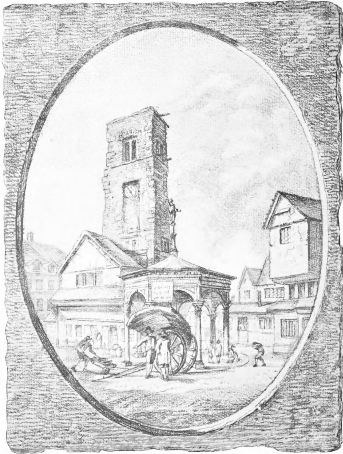
The Clock House and Conduit, St. Albans. From the Etching by B. Green, 1783.